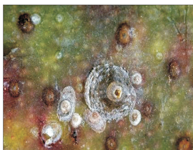
SAN JOSE DISEASE